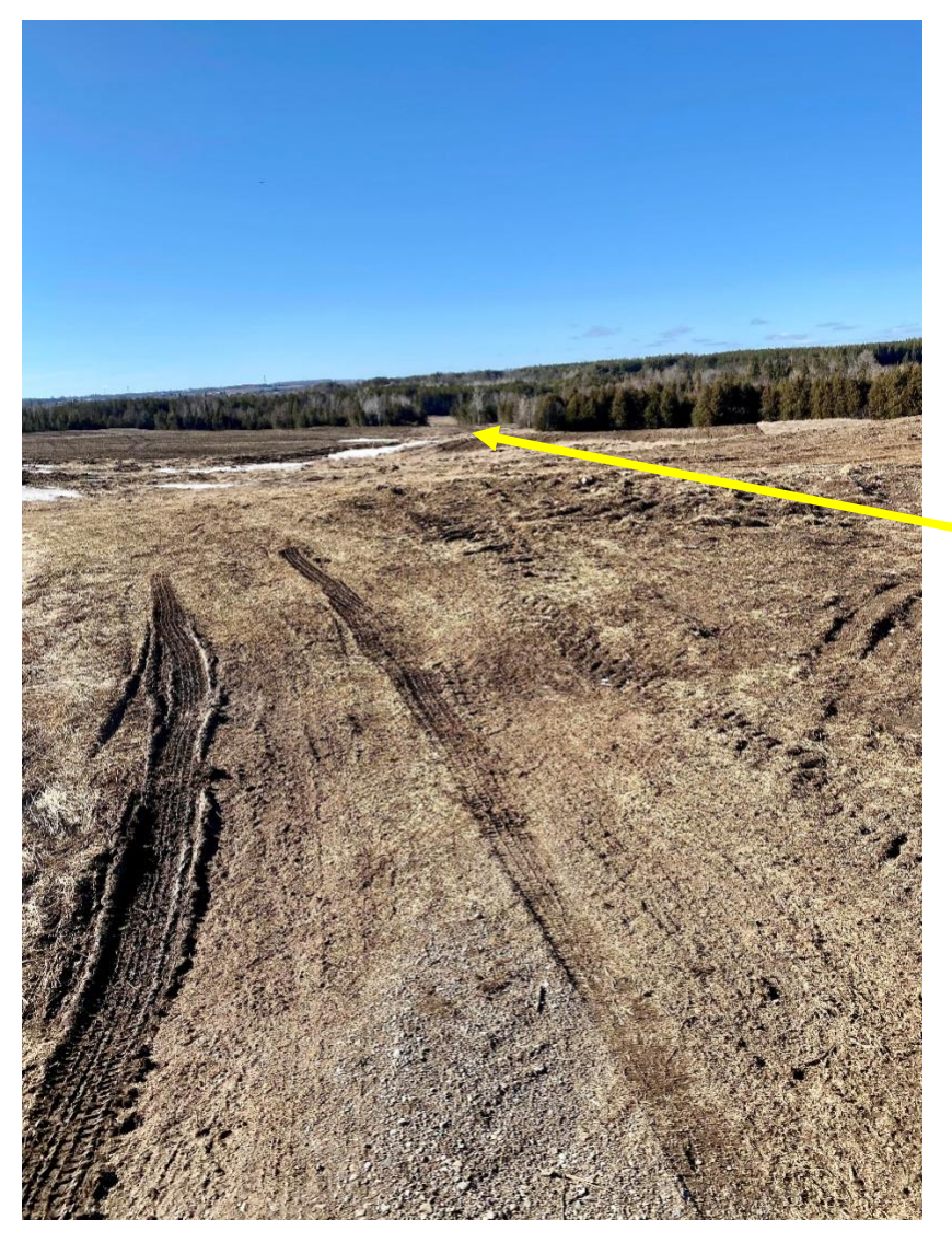
Photo 1. Looking northwest from entrance to property off Cty. Rd 52 Note "gap"