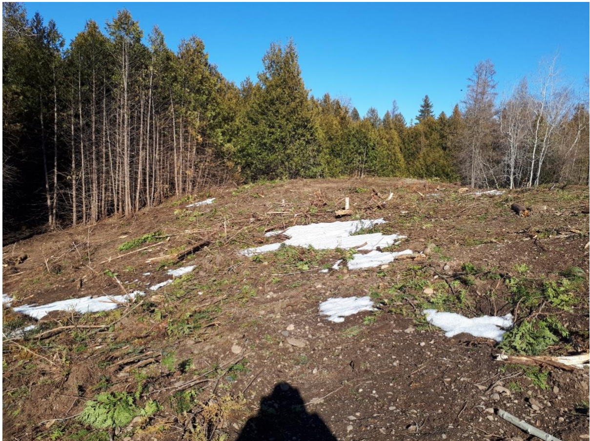
Photo 5. Looking East Tree Clearing