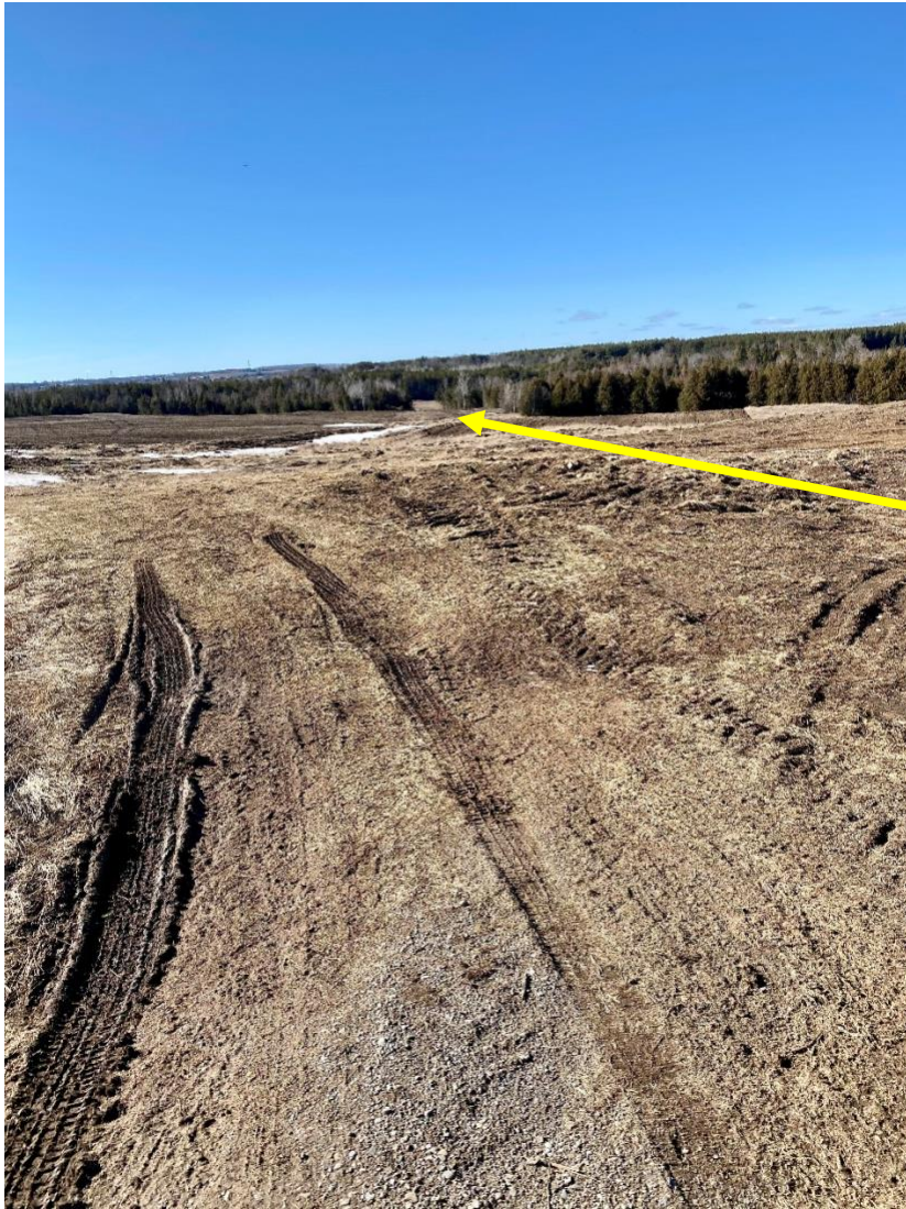
Photo 1. Looking northwest from entrance to property off Cty. Rd 52 Note "gap"