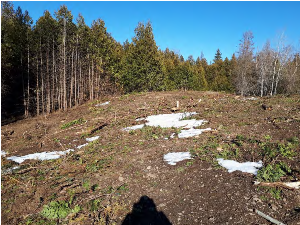
Photo 5. Looking East Tree Clearing