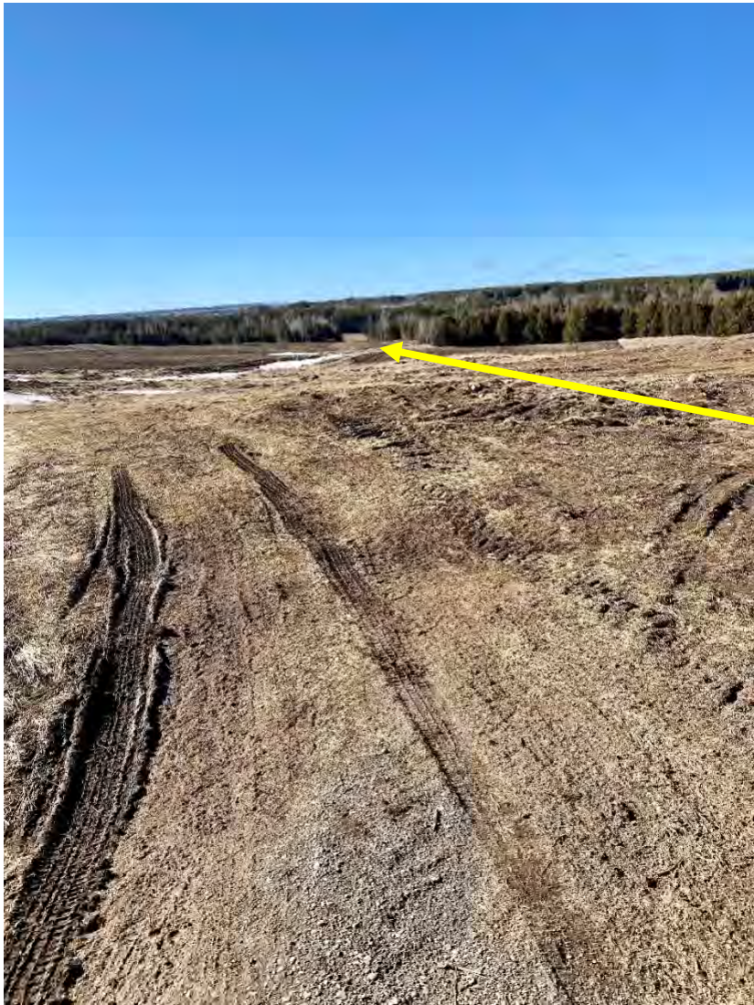
Photo 1. Looking northwest from entrance to property off Cty. Rd 52